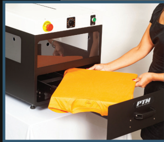
Front or side loading/rotational platen