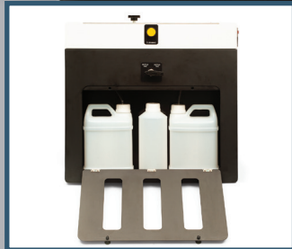
2 x 2 ltr pre-treat 1 x 1 ltr cleaning