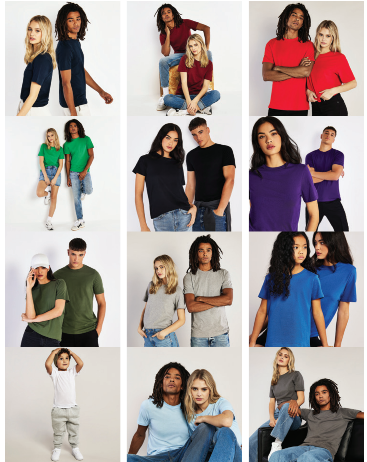
Left to right from top midnight, burgundy, red, kelly green, black, purple, military green, silver melange, royal, VAN406 white, sky blue and dark grey

Regular fit. Removable label. 1 x 1 rib neck. Self fabric back neck and shoulder tape. Top stitched front neck trim. Twin needle stitched hem and cuffs. Side seams for enhanced fit.