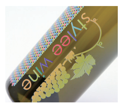
Beautiful seamless 360 degree surface printing with simple steps

Mount KEBAB on the UJF-3042HG, set the product on the rollers, and start the automatic 360 degree printing using the dedicated software "RasterLink 6".KEBAB allows printing on products with length between 30mm and 330mm and diameter between 10mm and 110mm (0.39 to 4.33in).